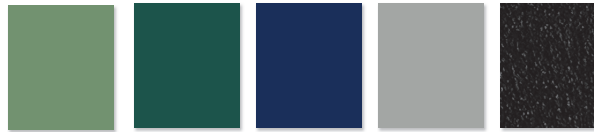
Patina Green Camarillo Green Midnight Blue Stormy Monday Textured Black