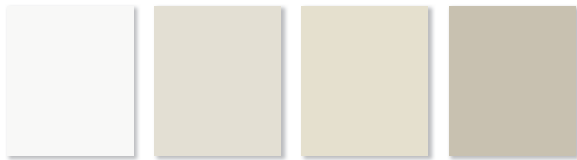
White Linen Ivory Sandstone