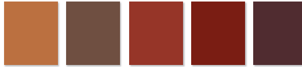
Burnt Pumpkin Copper Brick Red Redwood Boysenberry