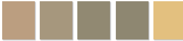
Coastal Tan Sierra Tan Putty Antique Bronze Sunflower