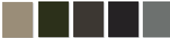
Matte Tan* Matte Desert Dust* Matte Bronze* Matte Sable* Matte Slate Gray*