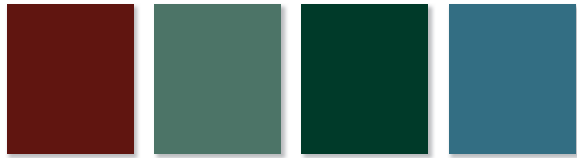
Cinnamon Sage Green Hunter Green Military Blue