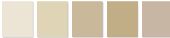
French Vanilla Burnt Sun Pueblo Tan Dijon Beige