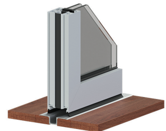
Bi-fold 3/4" recessed sill no drainage