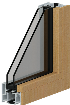
Bi-fold Alum Ext. Wood Int. Panel