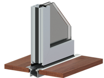
Bi-fold 1-1/2" recessed sill with drainage