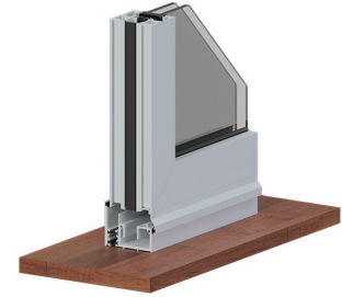
Bi-fold 2-3/16" STD surface track sill