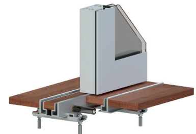
Lift & Slide 2-1/2" recessed sill with drainage