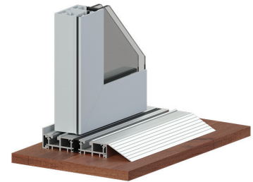
Lift & Slide 1-1/8" standard sill