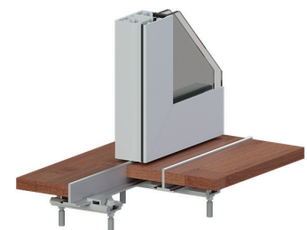
Lift & Slide 2-1/2" recessed sill no drainage