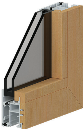
Lift & Slide Alum Ext. Wood Int. Panel