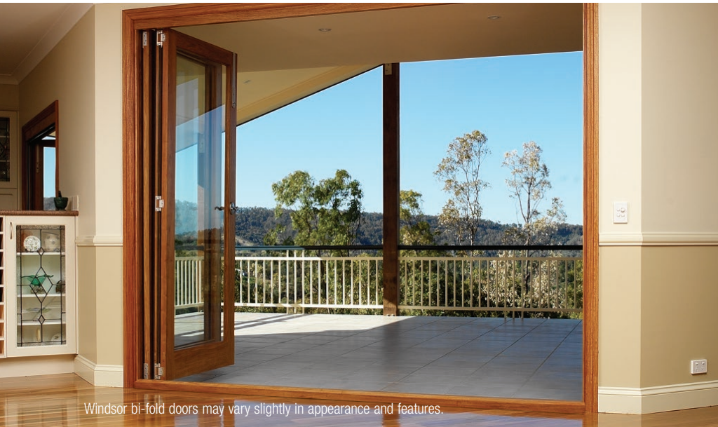
Windsor bi-fold doors may vary slightly in appearance and features.