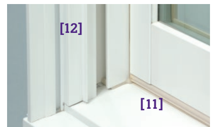
Double hung window with concealed jambliner