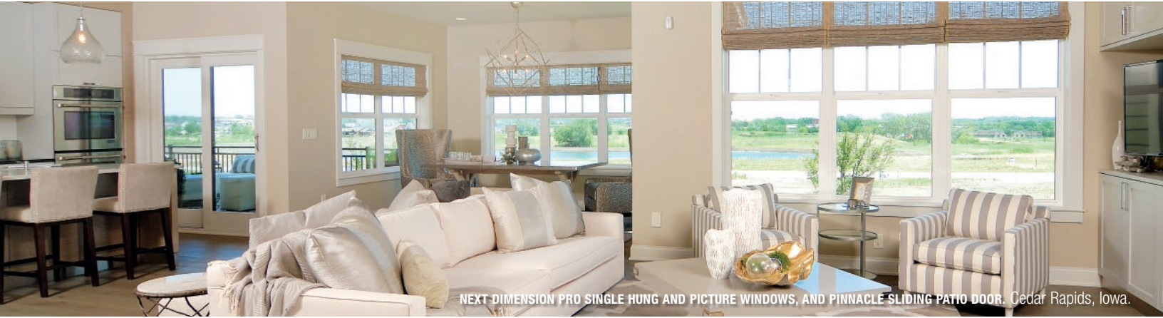
NEXT DIMENSION PRO SINGLE HUNG AND PICTURE WINDOWS, AND PINNACLE SLIDING PATIO DOOR. Cedar Rapids, Iowa.