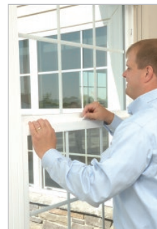
9. Fasten lock