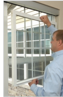
7. Insert sash into channel above clips