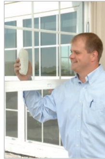
6. Exterior of upper sash is accessible from inside of house