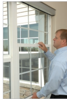
2. Lift sash above clips