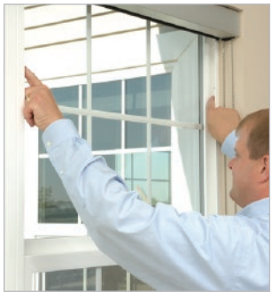
1. Open sash clips