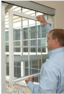
4. Disengage sash by pulling outward and to the left