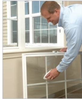
5. Complete removal of sash provides easy cleaning of lower sash