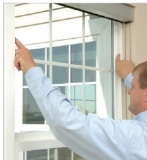
10. Close sash clips