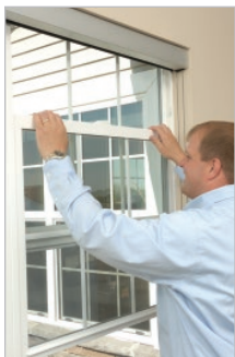
8. Lower sash to sill