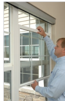
3. Shift sash to right within channel