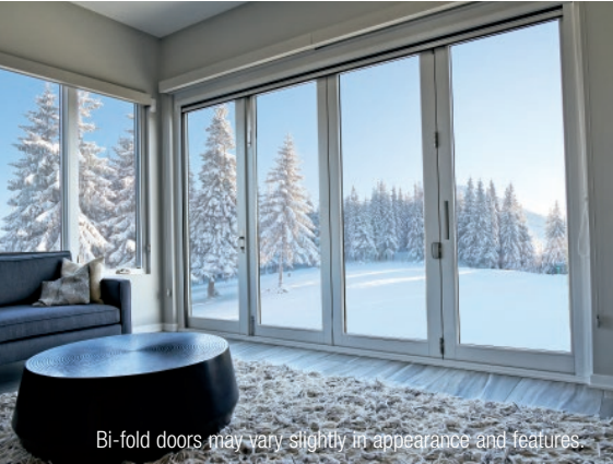
Bi-fold doors may vary slightly in appearance and features.