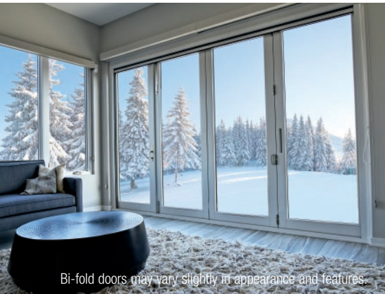
Bi-fold doors may vary slightly in appearance and features.