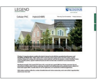
Legend microsite www.windsorlegend.com