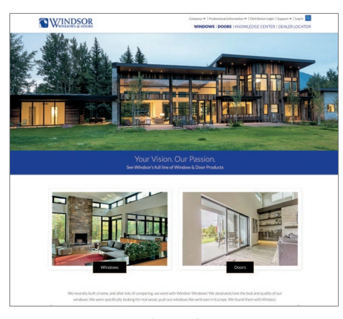
Corporate Site www.windsorwindows.com

Windsor products are sold by select dealers across the United States, Mexico and Canada. Visit a dealer for a personalized demonstration of windows and doors and see for yourself how Windsor can be your answer for quality products and passionate service.