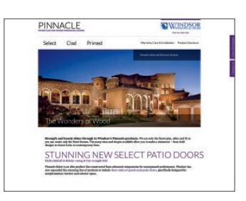
Pinnacle microsite www.windsorpinnacle.com