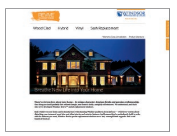
Revive microsite www.windsorrevive.com