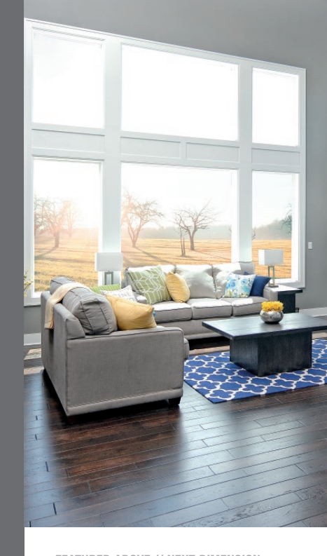
FEATURED ABOVE // NEXT DIMENSION SIGNATURE PICTURE WINDOWS. Ankeny, Iowa.