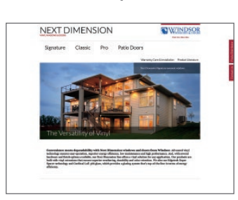
Next Dimension microsite www.windsornextdimension.com